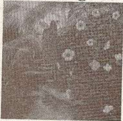
"By Way of Blossoms"